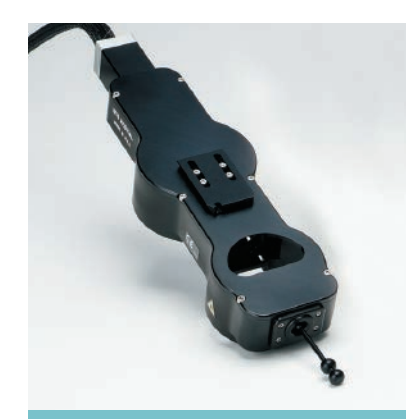
Using the Operating Microscope Adapter (OMA)

The best delivery device for tumors is the OMA. It provides precise control, great visualization, and a variety of spot sizes. The negative side of the OMA is that it only fits on Zeiss and Wildstyle microscopes that are not that common in veterinary hospitals. When using the OMA, the spot size selected should be the largest to cover the area of the tumor. In many cases, this will be the 2.0 mm spot size. After the tumor has been thoroughly treated, a smaller spot size can be used around the edges.