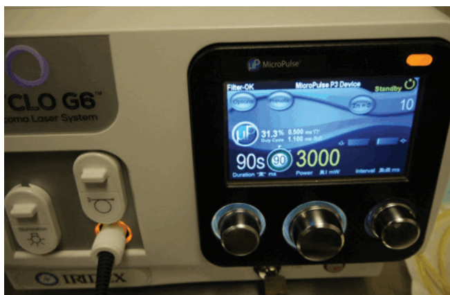
Figure 1. The Cyclo G6 laser (Iridex) is set at 3,000 mW of power for a duration of 90 seconds.