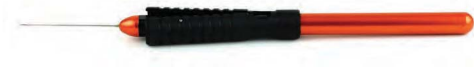
Re-Sposable Forceps (ILM style)