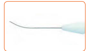
Curved Laser Probe 25ga.