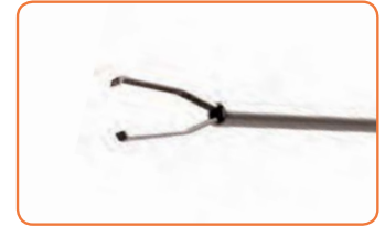
Reliable Tip Platforms