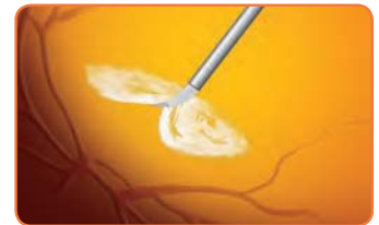
Sapphire Ocular Scraper