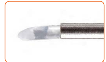
Regular Flex Membrane Scraper