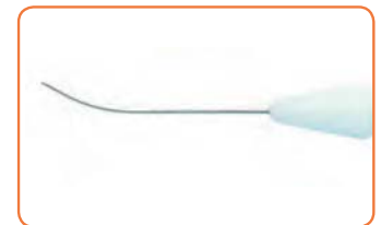
Curved Illuminated Laser Probe 25ga.