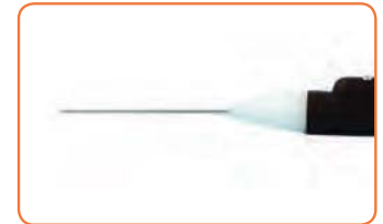
Aspirating Laser Probe