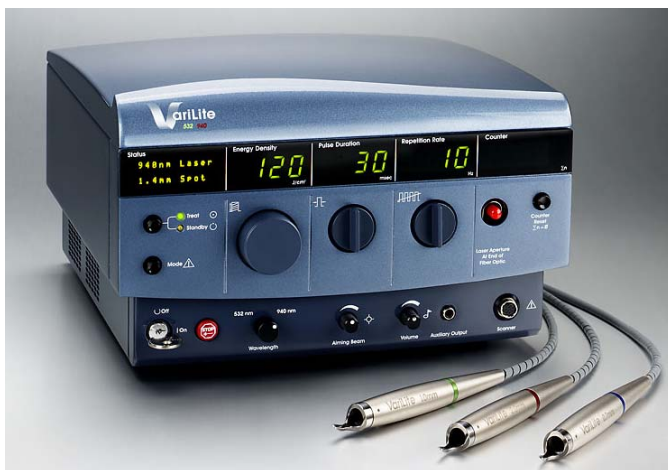
Figure 2. The VariLite offers 532 nm and 940 nm wavelengths in one integrated unit. Handpieces are available to deliver treatment spot sizes of 0.7, 1.0, 1.4, 2.0 and 2.8 mm.

A new dual wavelength laser allowing the selection of 532 nm and 940 nm output is now commercially available (VariLite™ by IRIDEX Corporation, Mountain View, CA, Figure 2). Both the 532 nm and 940 nm wavelengths are indicated for the treatment of vascular lesions. The objective of this study was to compare vessel response to treatment with both wavelengths as a function of vessel size.