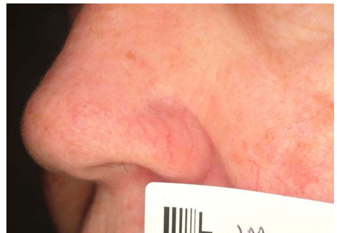
Figure 3. High-resolution digital photographs included a scale showing lines of 125, 200, 350, 500, 700, and 1000 microns in size to allow measurement of the size of specific vessel.

polarization digital photographs were taken prior to, immediately after, and 1 month after treatment. Photographs were evaluated by the treatment provider and an observer masked to the wavelength. Individual vessels were categorized by size using a scale included in the photographs (Figure 3) and graded for response. All vessels were treated with a 0.7 mm spot. Treatments were to protocol. The fluence for each wavelength, once chosen for a patient, was not changed during treatment. Protocol dictated single pulse, no overlap, and single pass. Topical 4% lidocaine was used around the nose for both wavelengths.