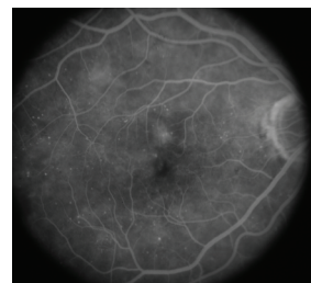
Figure 4. 6 Weeks Post-MicroPulse Treatment: VA: 20/25 -1