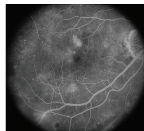
Figure 2. Pre-MicroPulse Laser Treatment: FA CSDME Right Eye. VA: 20/50 -1

The patient was seen for follow-up 6 weeks after treatment. After just the single treatment, there was a significant reduction in the retinal thickness, from 326 \mu\text{m} to 272 \mu\text{m} . As expected, there is no scarring or other visible sign of the laser spots (Figs 3, 4). Although the edema was not completely resolved, the VA improved by 2 lines, from 20/50 -1 to 20/25 -2 . The patient was pleased with the visual improvement. At a second follow-up 6 weeks later, the edema continued to resolve so we have not yet repeated the laser or given any additional Avastin injections.